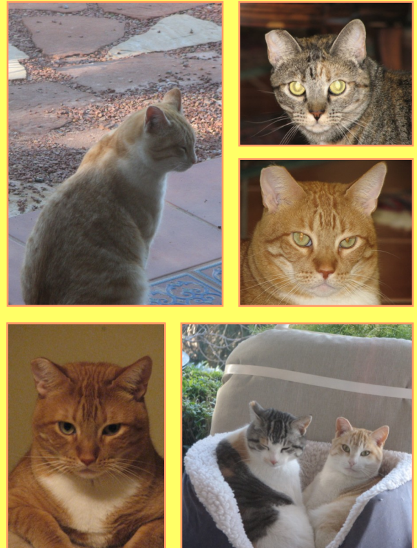
We don't litter!